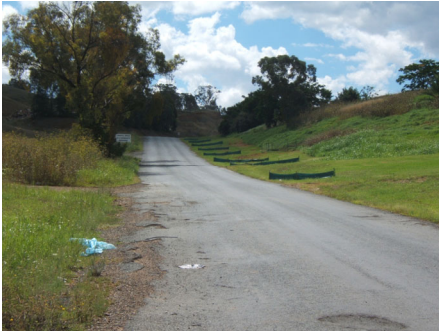
Sediment controls on access road