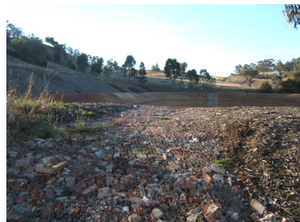
Reuse of C&D waste for stormwater pond inlet protection