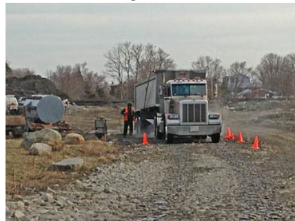
Pressure washing truck tyres prevents tracking dirt off-site