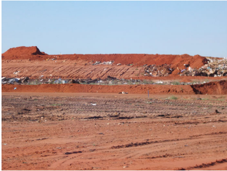
Rill erosion on exposed batter