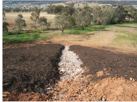
Erosion control on batter