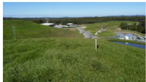
Buttonderry landfill, NSW – rehabilitation