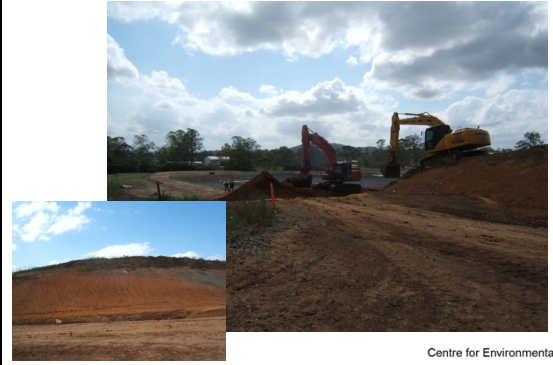
Rehabilitating cell cover