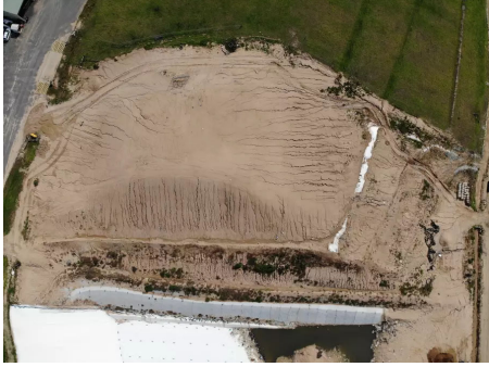
Erosion on final cover, Bega Valley NSW