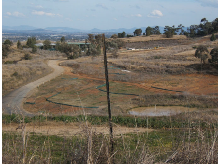
Rehabilitation area with sediment controls