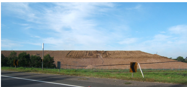
Irrigation of rehabilitation area