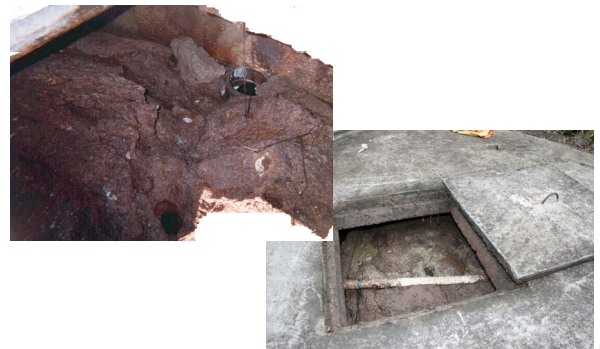
Centre for Environmental Training cet