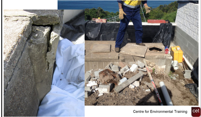
Centre for Environmental Training cet