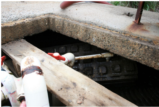
Centre for Environmental Training cet