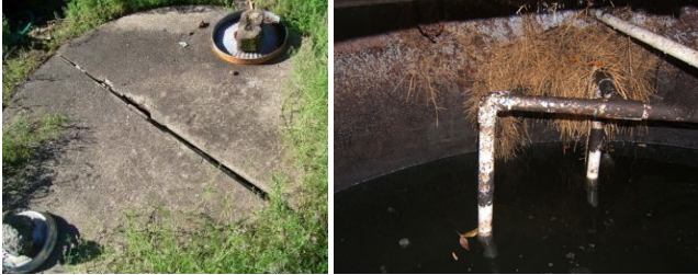
Centre for Environmental Training cet