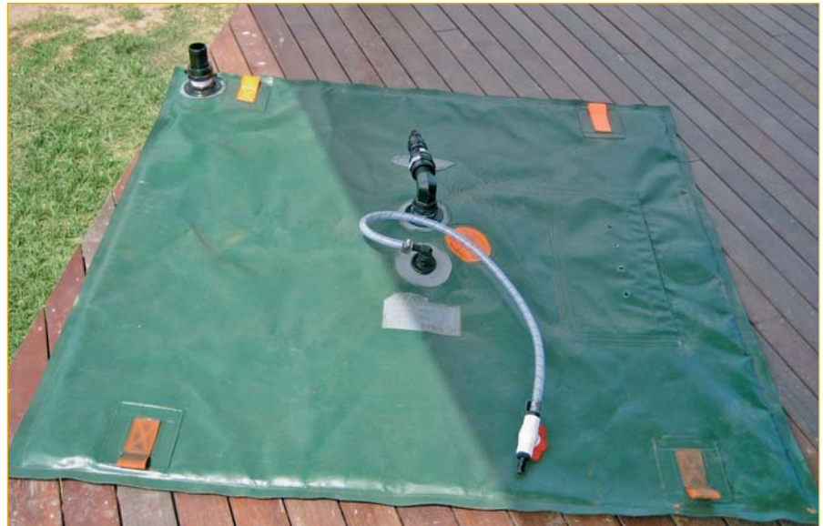
Figure 2. The 300 L storage bladder located under the house.

Odour problems have occurred due to poor design and where installations are not watertight. In projects where the UST are properly connected to the pipe system, these problems have not occurred. When connected and operating properly, residents from Swedish studies report that the odour problems in connection with UST do not appear to be greater than with other toilets.