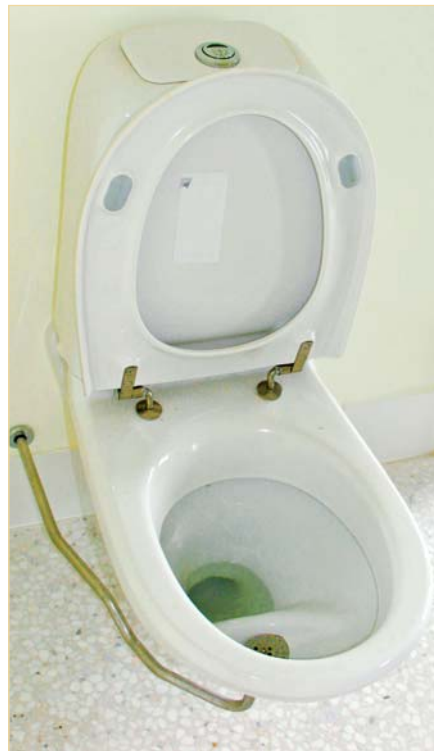
Figure 1. The Gustavsberg toilet selected for the trials.

In healthy humans, urine is a pathogenically sterile in the bladder (Johansson et al. 2002; Kvarnström et al. 2006). Freshly excreted urine normally contains different dermal bacteria. The most commonly observed pathogens excreted in urine of INFECTED patients are Salmonella typhi , Salmonella paratyphi , Mycobacterium tuberculosis , polyomaviruses,